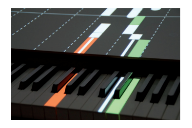
Figure 2: The current and next keys are highlighted on the piano's keyboard while the additional area also shows several upcoming notes.