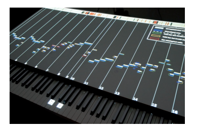
Figure 3: Detailed result screen feedback.