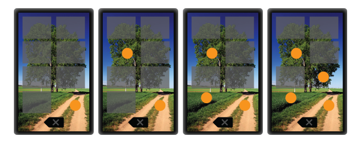
Figure 3: Selecting click points with multiple fingers in MIBA.

In comparison to CCP, the supported grid size needs to be drastically reduced in order to account for smaller screen size on smartphones and the reduction of accuracy when