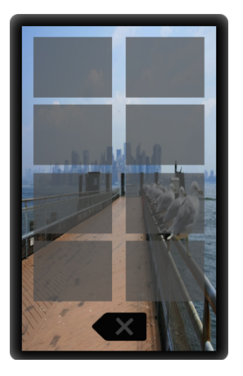
Figure 1: The MIBA scheme with a 4x2 grid of click points.