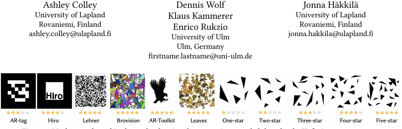
Figure 1: Markers evaluated in the study, showing the star-rating awarded them by the Vuforia target manager